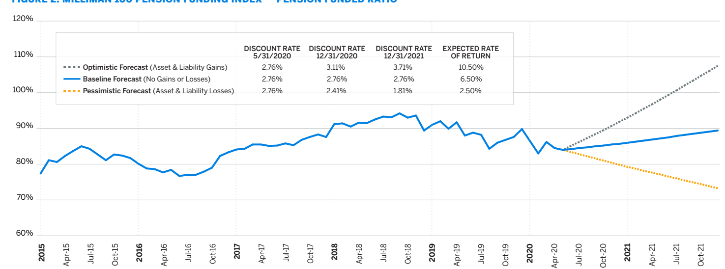
FIGURE 2: MILLIMAN 100 PENSION FUNDING INDEX — PENSION FUNDED RATIO

primary reason for the worsening of the funded status deficit has been a decline in discount rates over the past 12 months. During that period, discount rates decreased, moving from 3.61% as of May 31, 2019, to 2.76% a year later. The funded ratio of the Milliman 100 companies has decreased significantly over the past 12 months to 84.0% from 88.0%.